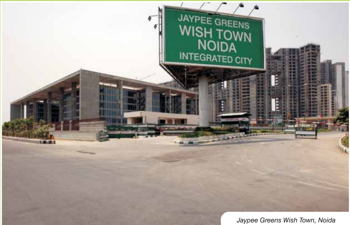
Jaypee Greens Wish Town, Noida