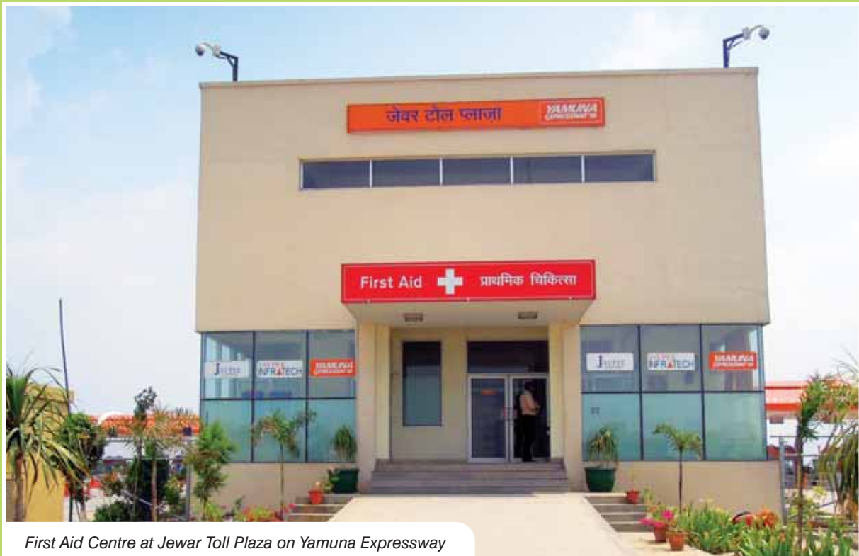
First Aid Centre at Jewar Toll Plaza on Yamuna Expressway