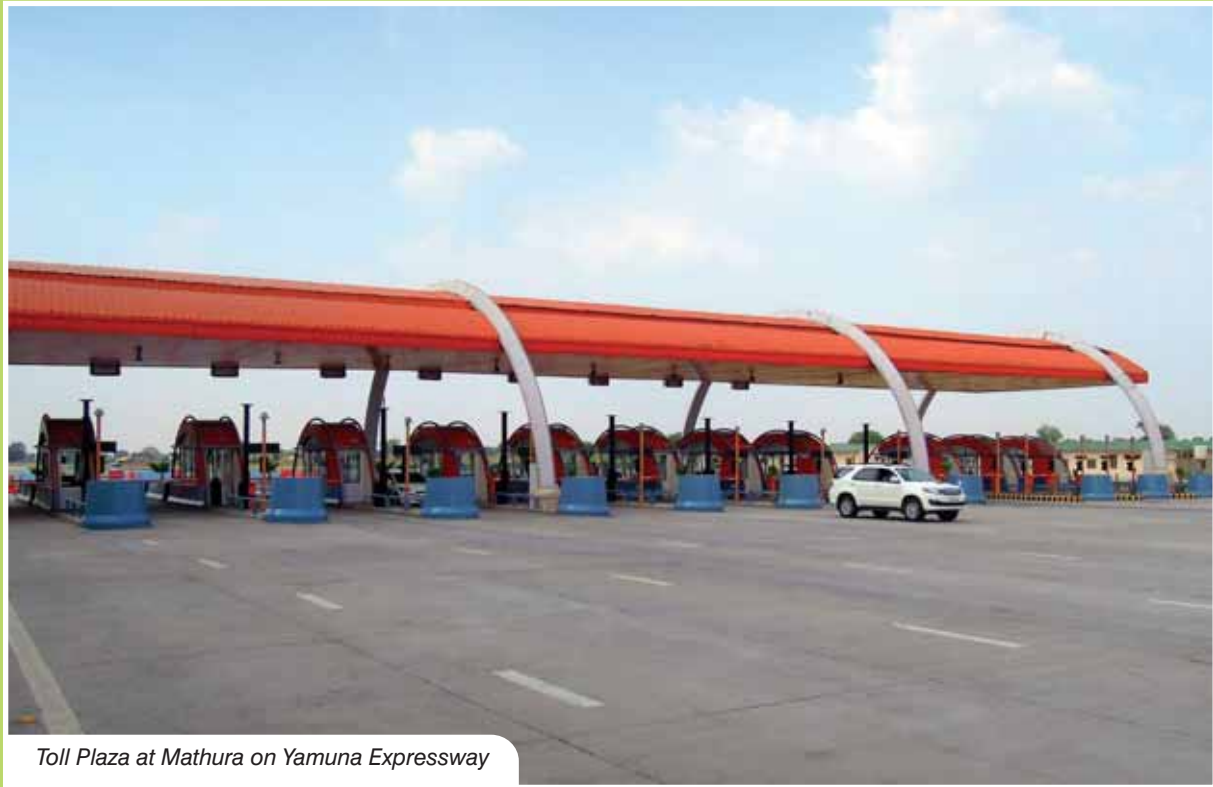
Toll Plaza at Mathura on Yamuna Expressway