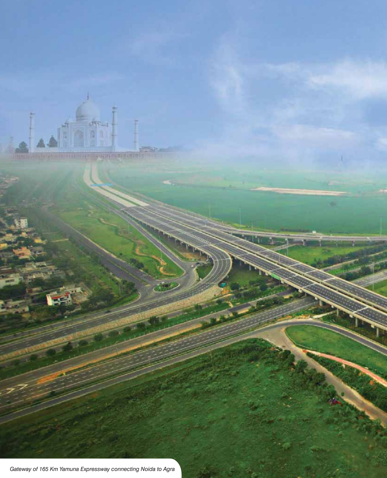
Gateway of 165 Km Yamuna Expressway connecting Noida to Agra