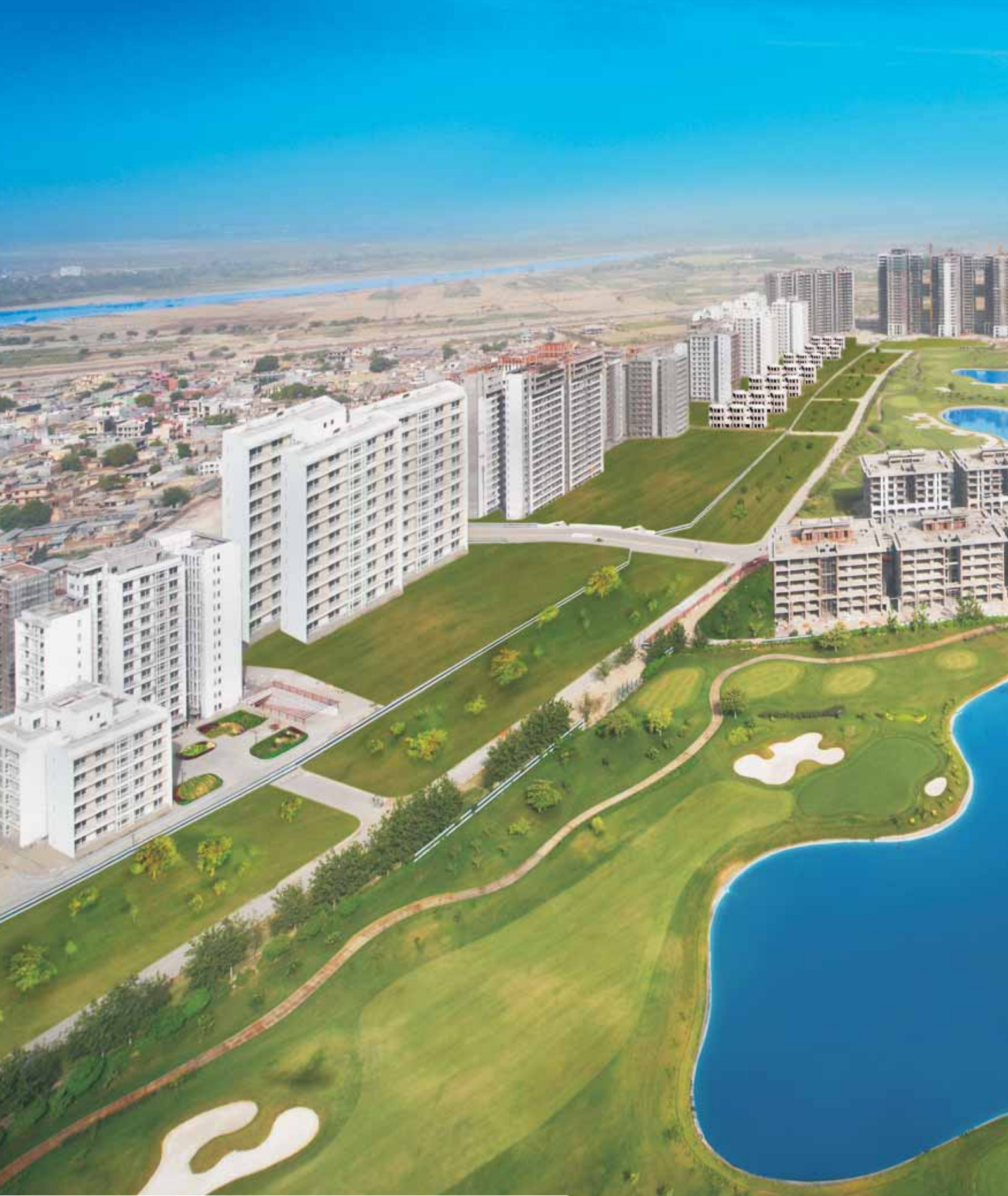
Actual Photograph of work in progress at 1st of 5 Integrated Cities, Wish Town, Noida