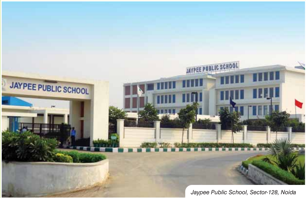
Jaypee Public School, Sector-128, Noida